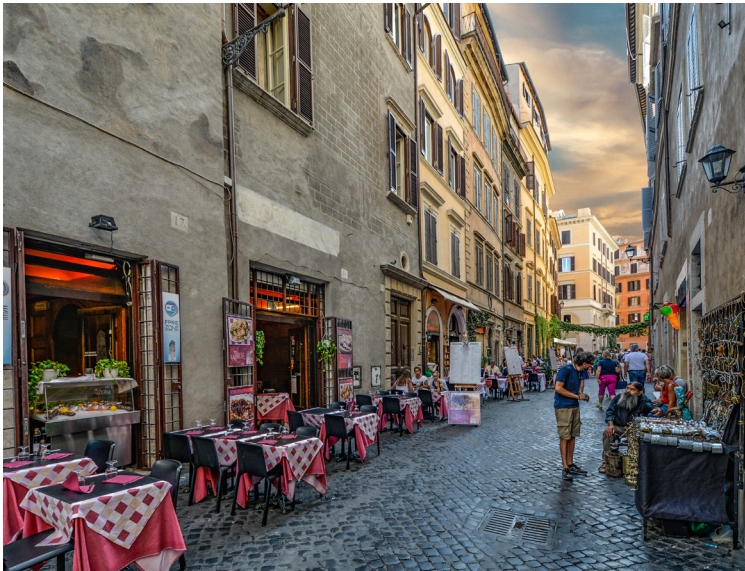
Tour: NX24 Code: A v.002 10/02/23

Purchase Domestic Airfare through NTS Includes Fuel Surcharges, Transfers and Taxes (subject to change) To fly from a city near you, call 1-800-929-4684, option 2 or register online at www.noseworthytravel.com